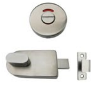
700 Series Indicator Set