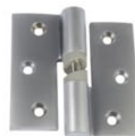
106 Gravity Hinge