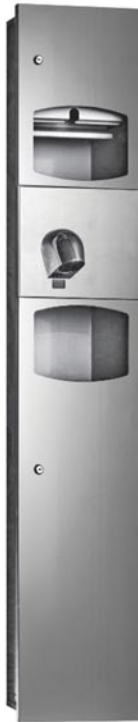
ML 73 N 1