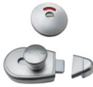
Xcel Series Slide Lock