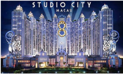
Studio City - Macau