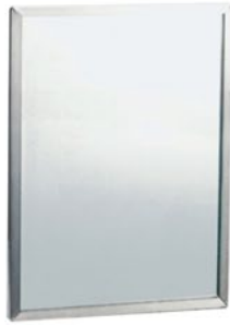
ML 771 Mirror