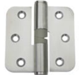
207SS Concealed Fix Gravity Hinge