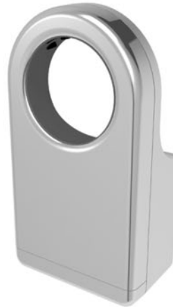
EcoMo Round Silver