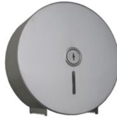
ML 841 Jumbo