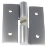
106B Bolt Through Gravity Hinge