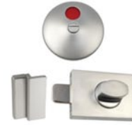
300 Series Indicator Set