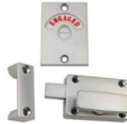
200 Series Indicator Set