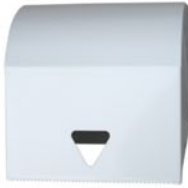
ML 4093 W