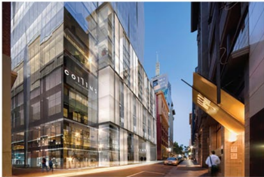
171 Collins Street - Melbourne