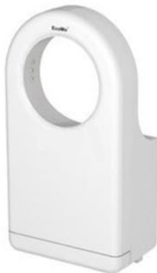
EcoMo Round White