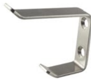
ML 4159 Coat Hook