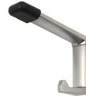
202C Coat Hook