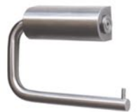
ML 4135 Single