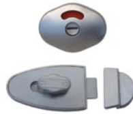
600 Series Slide Lock