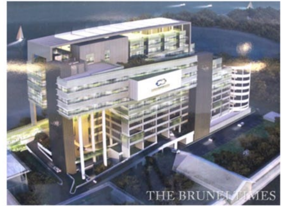
Brunei Cancer Centre