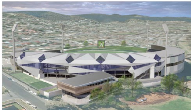
Blundstone Arena - Tasmania