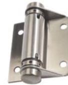
209 Stainless Steel Spring Hinge