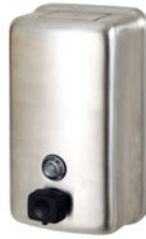
ML 602 BS