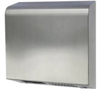
HK 100 N