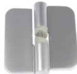
106C Concealed Fix Gravity Hinge