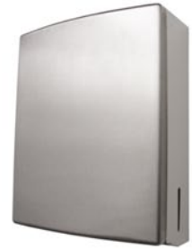
ML 725 AR