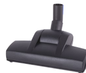
Turbine Brush 16019005