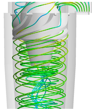
Swirl Tube Axial Cyclone Technology

The Advantage's 3-Tier, Dual Core, STAC® (Swirl Tube Axial Cyclone) technology combined with a high efficiency motor gives powerful and consistent suction. Tests show The Advantage picks up to 200- 300% more dirt and dust in a week versus conventional vacuums using bag filters. Vacuum more area in less time equals the best cleaning results.