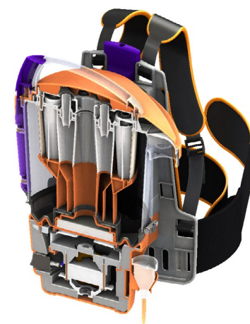
3 Tier Dual Core Filtration with Antibacterial Technology

The Advantage has Antimicrobial Technology in the internal plastics, vacuum hose and motor filter (Efficacy at >99.9%) and odour control inhibitors to help reduce and eliminate nasty germs and odours from being emitted back into the air. Leave cleaner, fresher air behind when you finish vacuuming, promoting a healthier environment for you and the people in it.