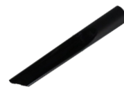
Crevice Tool 16019002