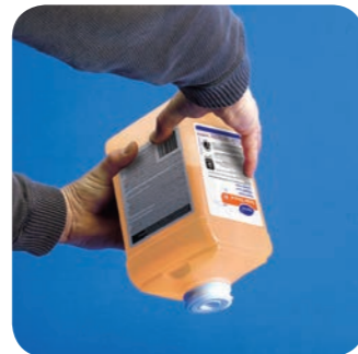
Patented in-cartridge metering for precise metering.