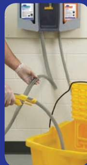
Remote high flow bucket activation.

QuattroSelect dispensing system allows you to choose from four different products with the turn of a dial. Simply select the product you desire, choose one handed low flow bottle fill or point of use bucket activation and dispense ready-to-use solutions into spray bottles, buckets and automatic scrubbers. The lockable cabinet helps eliminate unwanted cartridge removal.