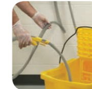
Remote high flow bucket activation

QuattroSelect dispensing system allows you to choose from four different products with the turn of a dial. Simply select the product you desire, choose one handed low flow bottle fill or point of use bucket activation and dispense ready-to-use solutions into spray bottles, buckets and automatic scrubbers. The lockable cabinet helps eliminate unwanted cartridge removal.