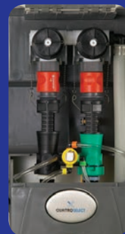
High flow and low flow quick change eductor system.