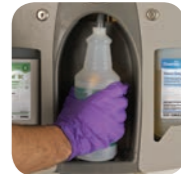
One handed bottle fill