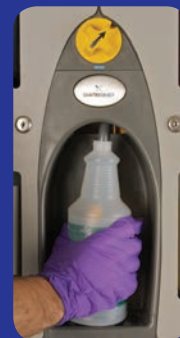
One handed bottle fill with self draining drip tray.