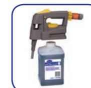
Fills automatic scrubbers, buckets and bottles quickly and easily

J-Fill Hand Held Portable consistently delivers accurate dilutions anywhere you need them. Simply select the product you desire, attach the Spill-Tite™ cartridge, hook up to a water supply and press the trigger. Dispenses into bottles, buckets and automatic scrubbers. Can be used with multiple products.