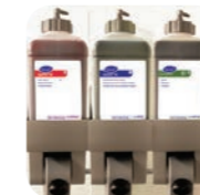
High flow bucket filling

The J-100 offers the flexibility of high-flow bucket/scrubber filling or low-flow bottle filling. Features safe chemical management, accurate dilutions and cost savings. Can be joined together to create a multi-unit dispensing system.