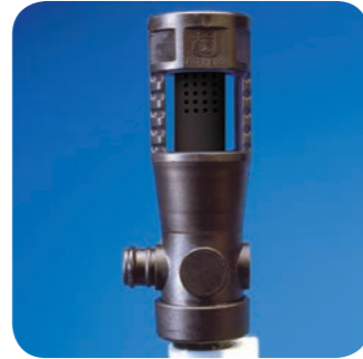
SafeGap™ and Air Gap eductors meet ATS 5200.033:2004 standard for back flow prevention.*

* Check local plumbing regulations for proper installation and back flow protection requirements