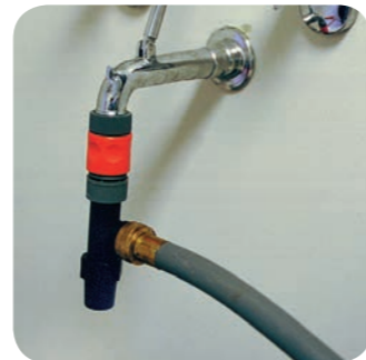
Filter valve unit enables easy water hookup and filters unwanted sediment.