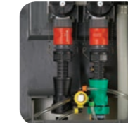
High flow and low flow quick change