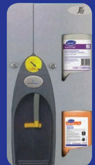
Durable molded cabinet for years of service.