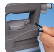
Lockable dispensing head eliminates cartridge removal